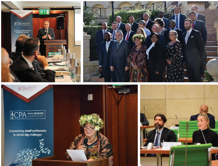
Small Branches network meet in Malta, January 2020

The Small Branches network uniquely brings together small national and sub-national jurisdictions.