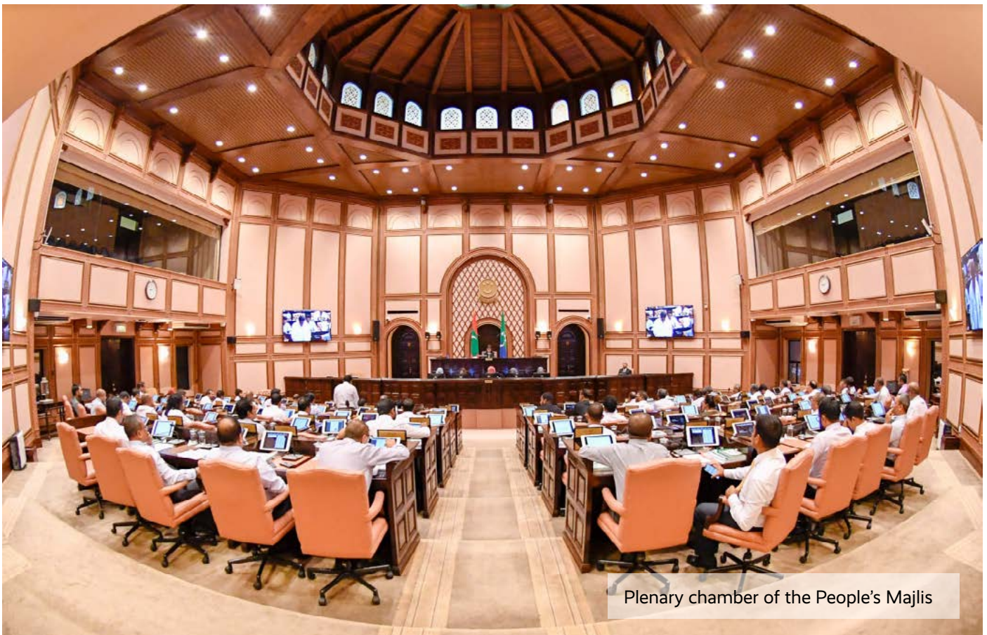
Plenary chamber of the People's Majlis

As per the Constitution 9 , Members of the People's Majlis are elected by residents of the capital city of Malé and Maldives' 20 inhabited atolls with two MPs being elected for each constituency and then one further representative elected for each additional 5,000 citizens registered in that administrative division. Parliamentary elections in Maldives are governed by the country's 2008 Electoral Act 10 which provides clear rules and regulations relating to the holding of and conduct within elections to the People's Majlis. These provisions are monitored and enforced by Maldives' independent Elections Commission 11 with recent national elections meeting international standards for openness and transparency following electoral observation visits by both the Commonwealth Secretariat 12 and European Union External Action Service. 13