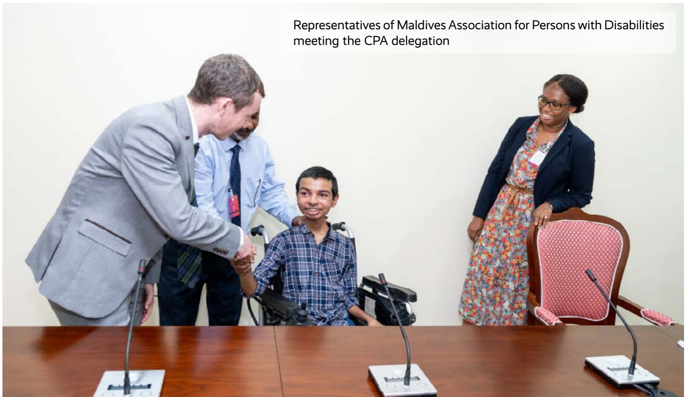
Representatives of Maldives Association for Persons with Disabilities meeting the CPA delegation

Making improvements in both of these critical areas would not only provide Members with important physical and digital capabilities useful for them to fully meet their legislative responsibilities but would also increase accessibility to and engagement with the People's Majlis for Maldivian citizens who are living with disabilities. Doing so would also bring the Parliament in line with best practices.