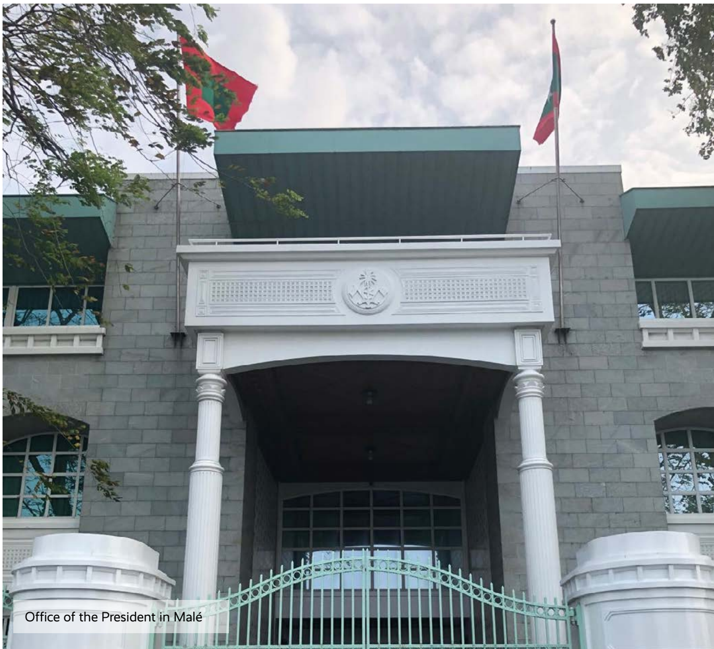
Office of the President in Malé