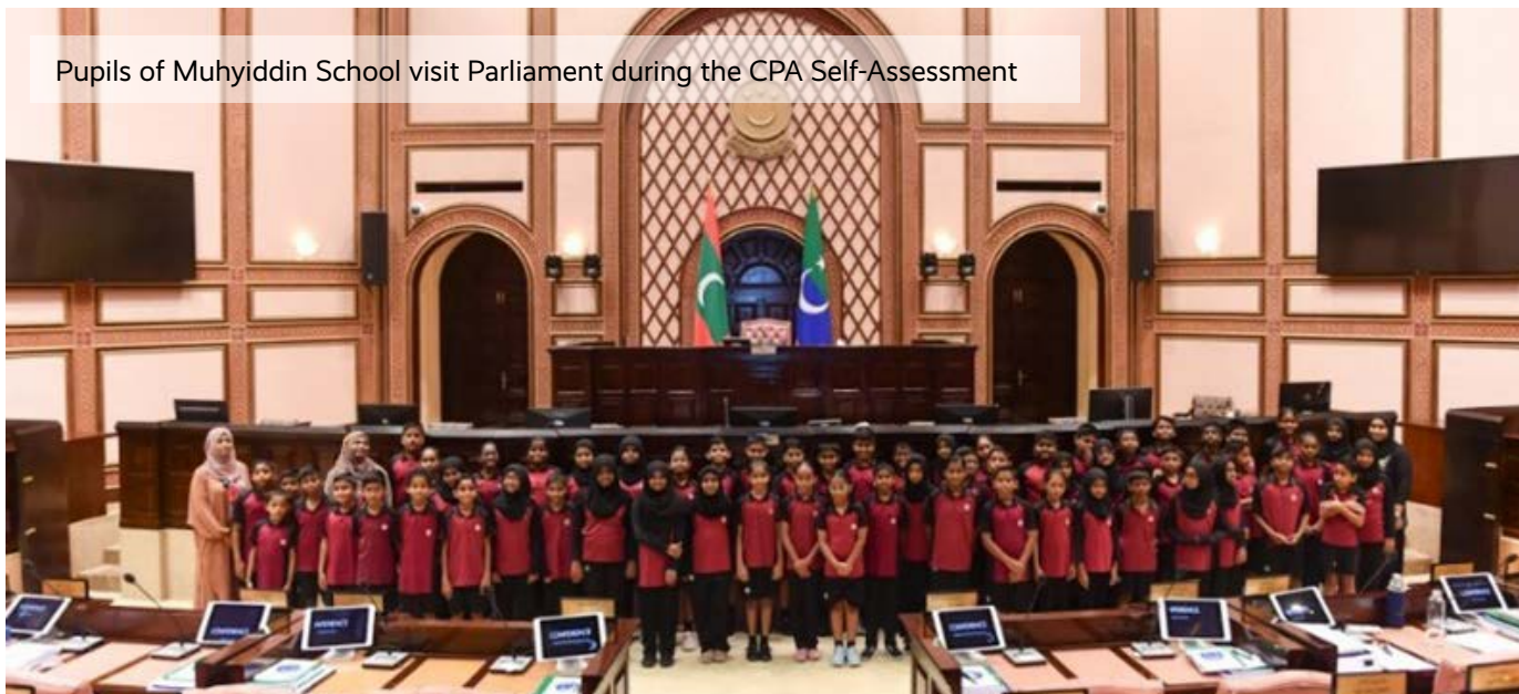
Pupils of Muhyiddin School visit Parliament during the CPA Self-Assessment

Practice Parliament – Practice Parliament programmes targeting youth and women have been conducted by the People's Majlis in partnership with UNDP Maldives. 52 The aim of these programmes is to provide an opportunity for both groups to build their capacity to participate in democratic processes and eventually put themselves forward for elected office. These initiatives combine training workshops on the fundamentals of civic education, key parliamentary processes, and relevant policy issues, as well as a mock practice sitting of the People's Majlis in which participants can take their seat in the Chamber and participate in a range of parliamentary proceedings.