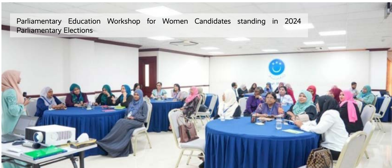
Parliamentary Education Workshop for Women Candidates standing in 2024 Parliamentary Elections

While all of these initiatives above are undoubtedly positive (and the Legislature should be commended for maintaining them on a regular basis), various stakeholders consulted as part of the Self-Assessment exercise suggested that Parliament could further improve engagement with the electorate through strengthening its working relationships with Maldivian Civil Society Organisations (governed by the 2022 Associations Act 53 which established mechanisms to ensure the accountability of associations and to provide them with a legal framework to contribute towards the development of Maldivian society).