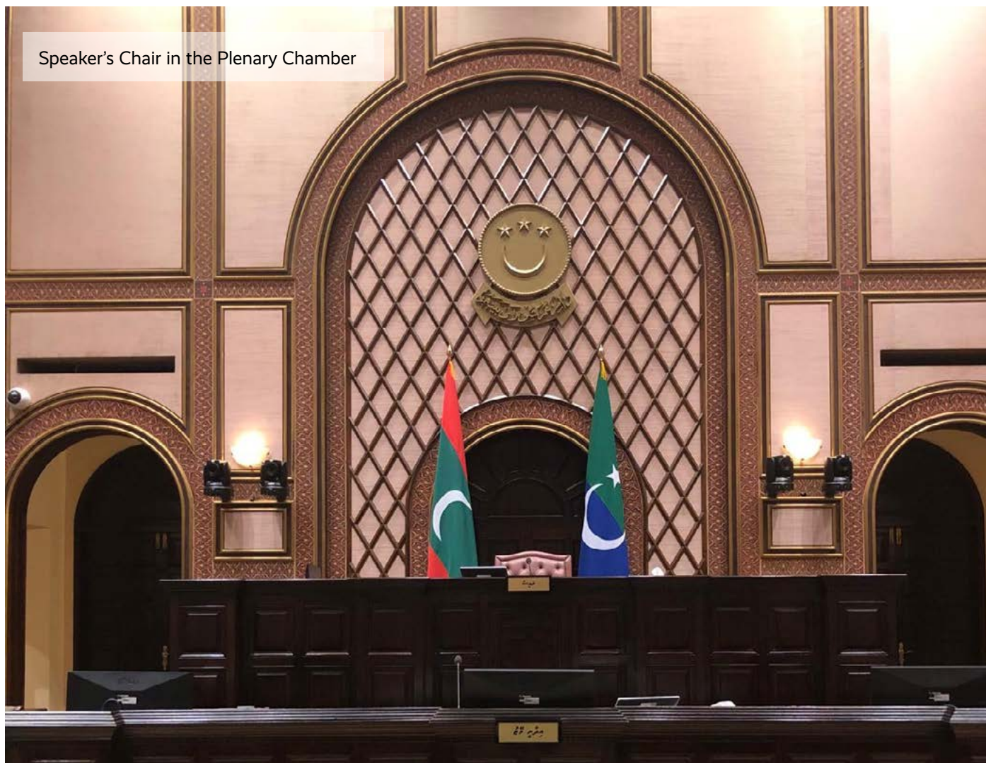
Speaker's Chair in the Plenary Chamber