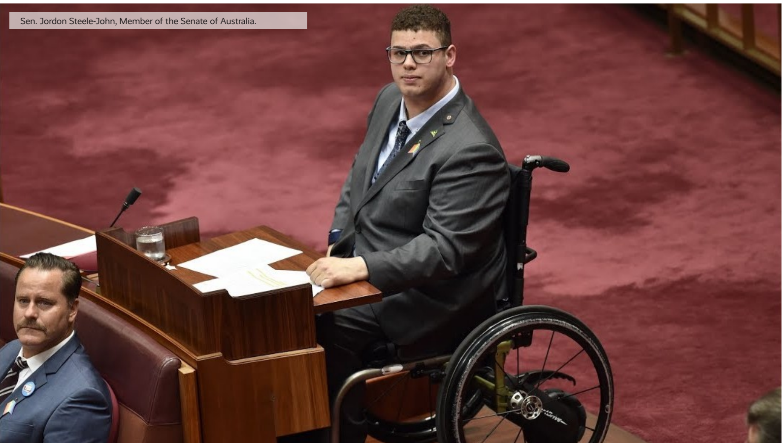
Sen. Jordon Steele-John, Member of the Senate of Australia.

To encourage Commonwealth Parliaments to enable effective and full participation of persons with disabilities at all levels