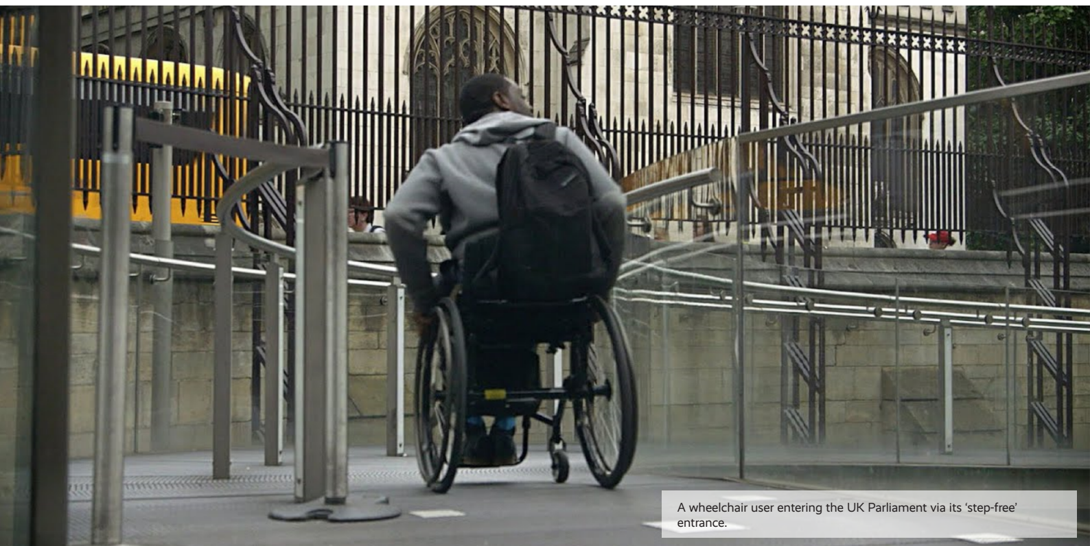
A wheelchair user entering the UK Parliament via its 'step-free' entrance.

The Strategic Plan seeks to establish a streamlined strategic results framework to ensure greater linkage between the overarching mission statement and the subsequent outcomes, outputs and thematic activities set out to achieve the Network's mission. A separate Business Plan will accompany the Strategic Plan and will be produced on an annual basis. The Business Plan will include specific planned activities, deliverables and budgets for the year, which will be linked to the Strategic Plan's mission statement and outcomes.