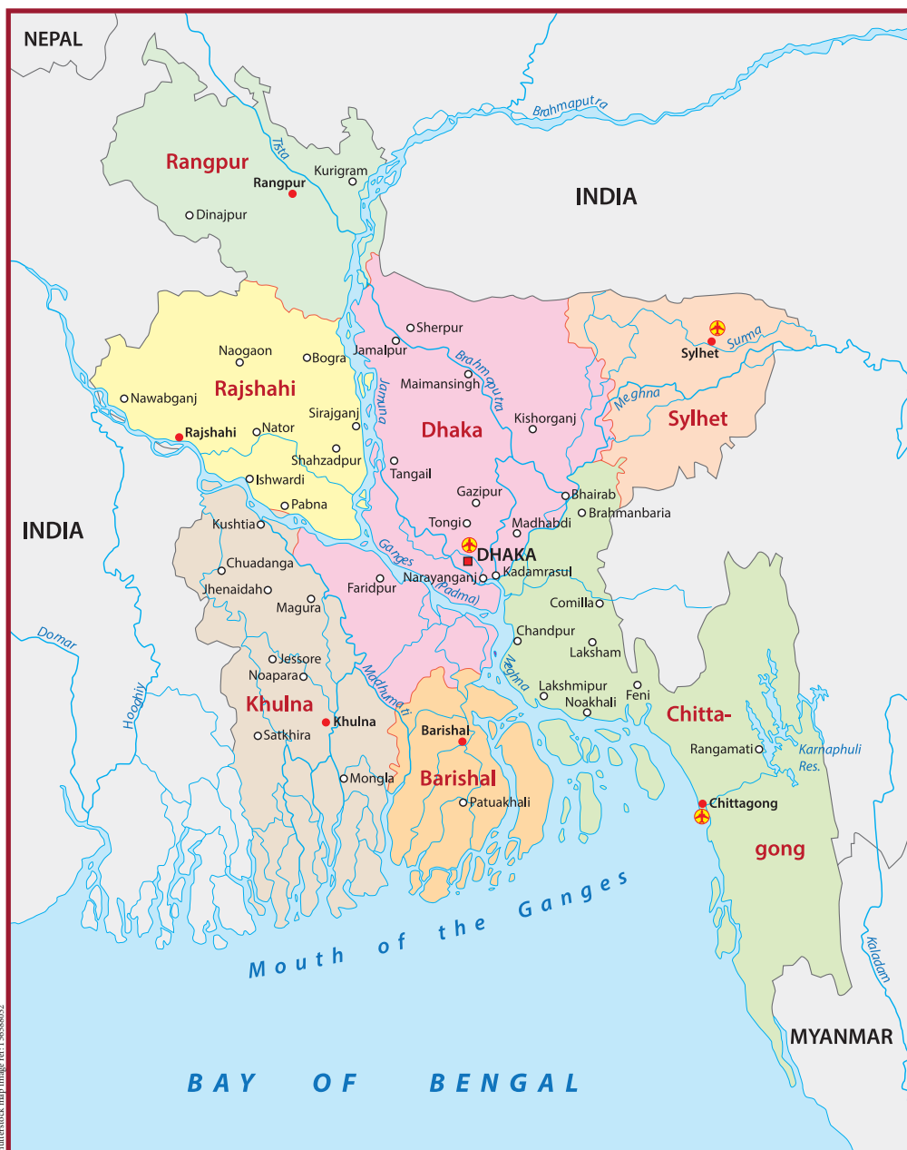
Shutterstock map image ref: 15658802

The President of Bangladesh appoints a cabinet with the Prime Minister and other ministers from among the Members. The Prime Minister must be a Parliamentarian, and so must at least 90% of the Ministers. The President must appoint a Prime Minister who, in their opinion, commands the confidence of the majority of the House. The cabinet