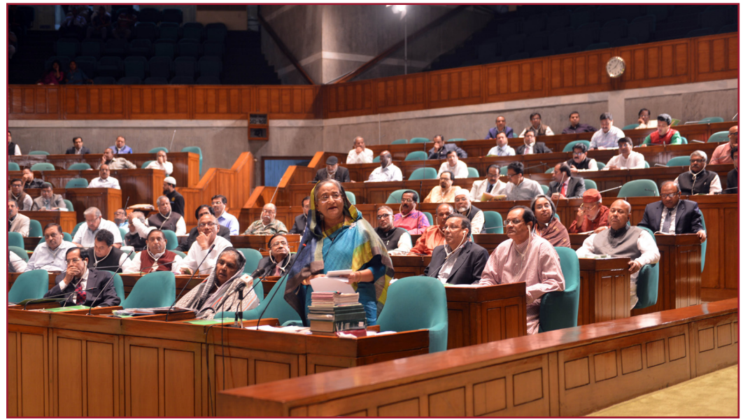
Above: The Hon. Prime Minister of Bangladesh, Sheikh Hasina addresses Parliament in Bangladesh.

In 2013, the Contempt of Court Act, 2013 was passed in Parliament. The Act was challenged before the High Court and it observed that total freedom without restriction leads to total chaos. The court could not allow such kind of freedom of the journalist who had no legal