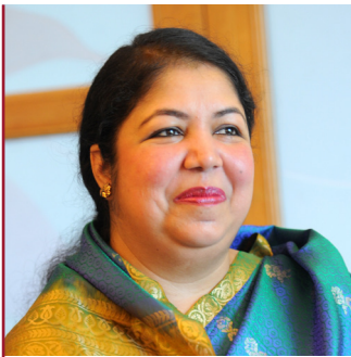
Hon. Dr Shirin Sharmin Chaudhury, MP, CPA President, Chairperson of the CPA Executive Committee and Speaker of the Bangladesh Parliament.

The Hon. Speaker of the Parliament of Bangladesh looks ahead to the 63 rd Commonwealth Parliamentary Conference in Dhaka and welcomes delegates.