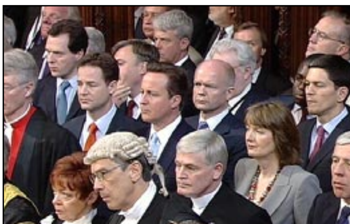
Prime Minister Cameron (centre, pale blue tie) flanked by Deputy Prime Minister Clegg (left) and Acting Opposition Leader Rt Hon. Harriet Harman (right) as MPs and Commons officials stood in the entrance to the House of Lords for the Queen's Speech.

Among the records set this year was the entry of 232 newcomers into the House, partly due to the number of Members who left because of the scandal over Members' expenses. Women won 143 seats, up from 128 in the 2005 election. The Green Party won its first seat although it received just under 286,000 votes nationally, compared to the U.K. Independence Party and the British National Party who received 918,000 and