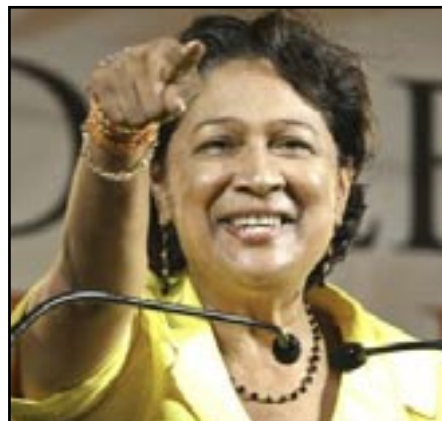
Hon. Kamla Persad-Bissessar.

The alliance won 29 seats, ending the three-term government of the People's National Movement (PNM) led by outgoing Prime Minister Hon. Patrick Manning.