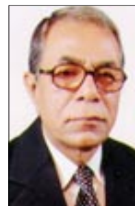
Hon. Abdul Hamid, MP Branch: Bangladesh

Office: Speaker of Parliament Party: Awami League First elected: 1970 Background: Lawyer