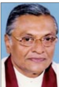
Hon. Chamal Rajapaksa, MP Branch: Sri Lanka

Office: Speaker of Parliament Party: United People's Freedom Alliance First elected: 1989 Background: Land proprietor