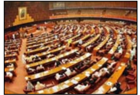
The National Assembly in session.

The amendment was reportedly drafted to clear the constitution of changes brought