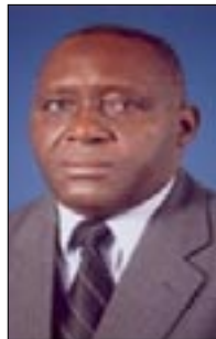
Hon. VICENTE Z. ULULU, MP Branch: Mozambique

Office: None Party: Renamo First elected: 1994 Background: Printing