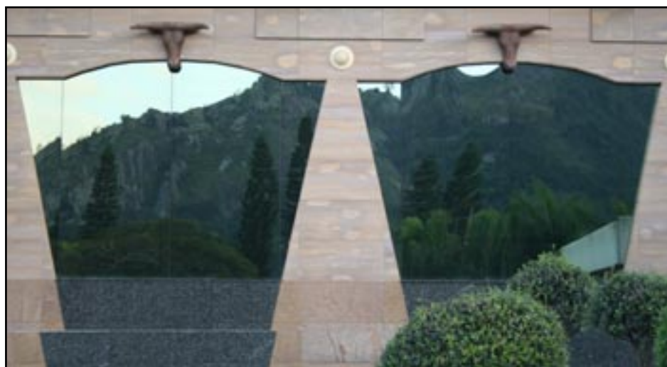
The mountains of Swaziland are reflected in the windows of Lozitha State House where CPA Executive Committee Members met H.M. King Mswati III at the conclusion of their meeting.

Enhanced solutions to such major world challenges as global economic realignment, migration, disaster recovery and food and water shortages will be sought when the Commonwealth's foremost gather of Parliamentarians takes place later this year.