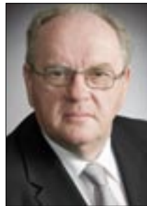
Hon. Michael Polley, MP Branch: Tasmania

Office: Speaker of the Legislative Assembly Party: Labor First elected: 1972 Background: Politics