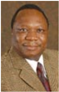
Hon. Mninwa J. Mahlangu, MP Branch: South Africa

Office: Chairperson of the National Council of Provinces Party: African National Congress First elected: 1994 Background: Business