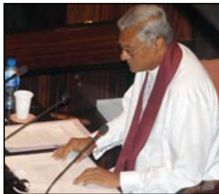
Speaker Rajapaksa swearing the oath of office in Parliament.

The amendment also enhanced provincial autonomy and ended the President's unilateral authority to declare emergency rule in a province.