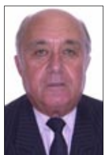
Lt Col. Hon. Ernest Britto, MP Branch: Gibraltar

Office: Minister for Environment and Tourism Party: Gibraltar Social Democrats First elected: 1988 Background: Military