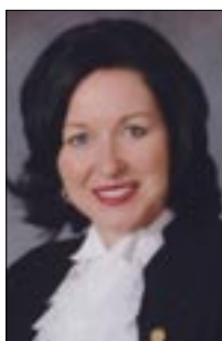
Hon. Kathleen Casey, MLA Branch: Prince Edward Island

Office: Speaker of the Legislative Assembly Party: Liberal First elected: 2007 Background: Civic government