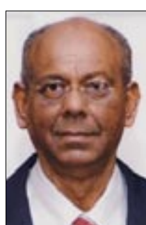
Hon. Hari N. Ramkarran, MP Branch: Guyana

Office: Speaker of the National Assembly Party: People's Progressive Party-Civic First elected: 1997 Background: Attorney