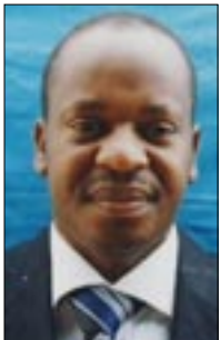
Hon. Job Yustino Ndugai, MP Branch: Tanzania

Office: None Party: Chama Cha Mapinduzi First elected: 2000 Background: Wildlife management