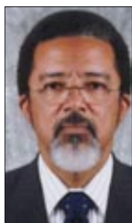
Hon. Keith Flax, MHA Branch: British Virgin Islands

Office: Deputy Speaker of the House of Assembly Party: Virgin Islands Party First elected: 1983 Background: Project management