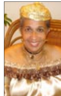
Hon. Alix Boyd Knights, MHA Branch: Dominica

Office: Speaker of the House of Assembly Party: None First elected: 2000 Background: Attorney