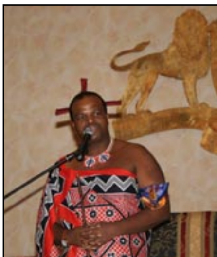
King Mswati III addresses Members of the CPA Executive Committee.

The discussions on environmental issues continue the work of the CPA Climate Change Task Force formed at the 55th Conference last September in Arusha, Tanzania, to provide reliable information to Members on environmental issues.