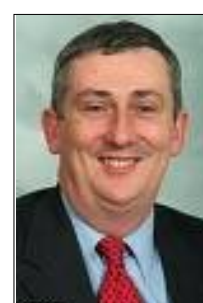
Mr Lindsay Hoyle, MP Branch: United Kingdom

Office: Chairman of Ways and Means Party: Labour First elected: 1997 Background: Local government