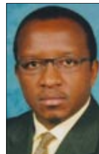
Hon. Marwick Khumalo, MP Branch: Swaziland

Office: Committee Chairperson Party: None First elected: 1998 Background: Broadcasting