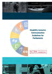
SOME OF OUR RECENT RESOURCES AND PUBLICATIONS