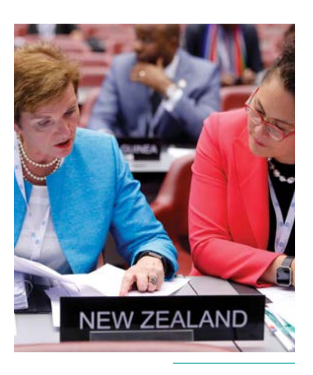
Meeting of the Committee on Democracy and Human Rights during the 138<sup>th</sup> Assembly of the IPU, Geneva, 2018

The vital role of parliaments in promoting respect for universal human rights norms has also been repeatedly recognised by the United Nations, especially by its Human Rights Council (the Council) and the General Assembly. For example, the Council has adopted four resolutions (resolutions 22/15, 26/29, 30/14, and 35/29) that acknowledge 'the crucial role that parliaments play in, inter alia, translating international commitments into national policies and laws and hence in contributing to the fulfilment by each State Member of the United Nations of its human rights obligations and commitments and to the strengthening of the rule of law, '13 and which also recognise 'the leading role that parliaments could play in ensuring the implementation of recommendations made at the