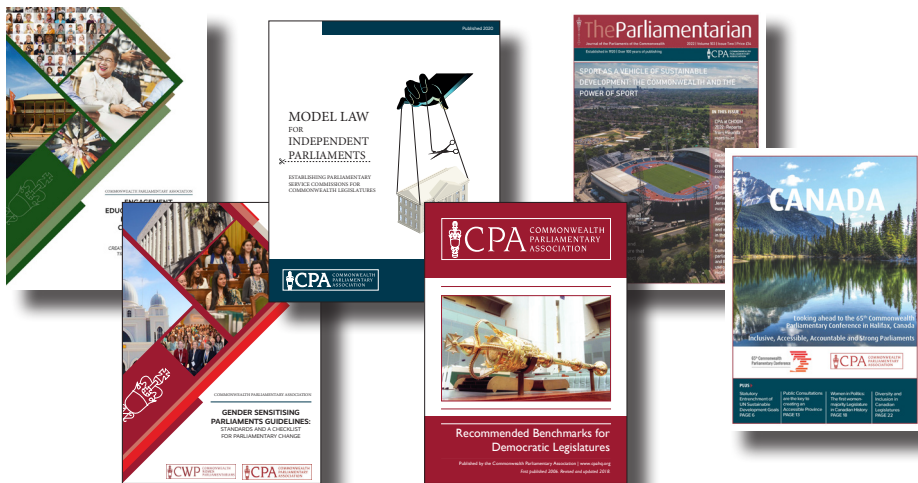
SOME OF OUR RECENT RESOURCES AND PUBLICATIONS

The CPA works with a wide range of organisations to deliver programmes which strengthen Commonwealth Parliaments, supports and promotes parliamentary democracy in accordance to the Commonwealth Charter and which aligns with the Sustainable Development Goals. Some of our recent partners include: inter-governmental organisations; regional organisations; academic institutions; non-governmental organisations; professional training bodies; private businesses; think tanks and other research bodies.