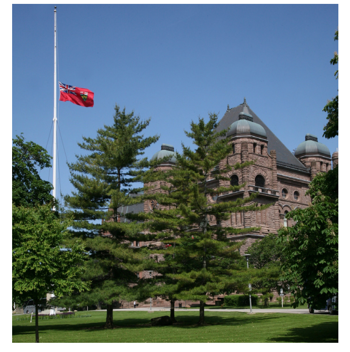
Above: The flag is flown at half mast at the Legislative Assembly of Ontario in tribute to Queen Elizabeth II.