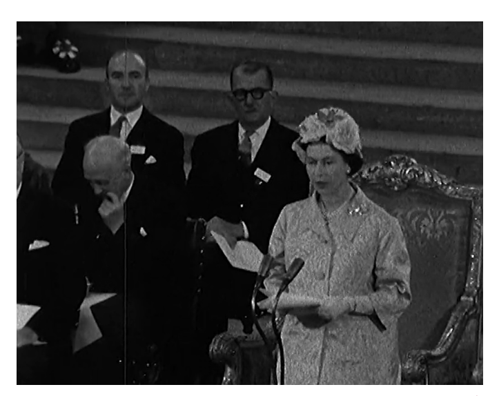
Above: Queen Elizabeth II came to Westminster Hall to open the 7<sup>th</sup> Commonwealth Parliamentary Conference in 1961.

In this modern age, the strength and unity of the Commonwealth family does not lie in bonds forged by formal instruments, nor in common ancestry, nor in pursuing the same political line. It springs from the knowledge that we all share a lively concern for individual freedom and all the machinery which makes this possible." - HM Queen Elizabeth II