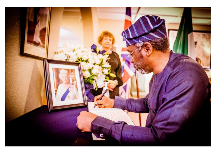
Above: The Speaker of the House of Representatives of Nigeria, Hon. Femi Gbajabiamila signs the book of condolence for Queen Elizabeth II at the British High Commission in Abuja.

blindness within the Commonwealth. May the soul of Her Majesty Queen Elizabeth II rest in eternal peace.