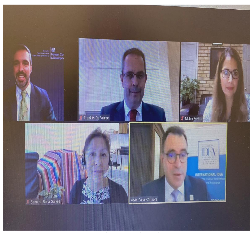
Panelists at the launch

Climate Strikers Day of Action: Hundreds of thousands of persons from 99 countries of the world have joined a coordinated and global climate strike calling on governments to intensify actions in tackling ecological issues. Read more here: <a href="https://bit.ly/2WeaDX6">https://bit.ly/2WeaDX6</a>